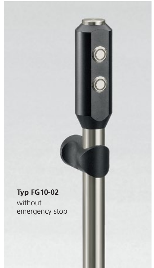
Typ FG10-02 without emergency stop