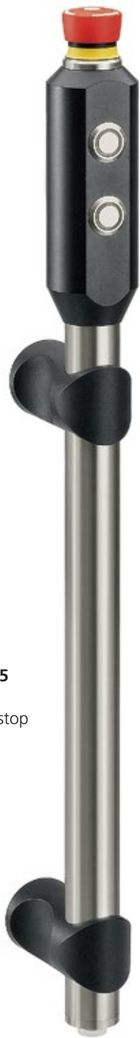
Typ FG10-05 with emergency stop