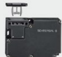
Door solenoid tumbler see page 304–305.