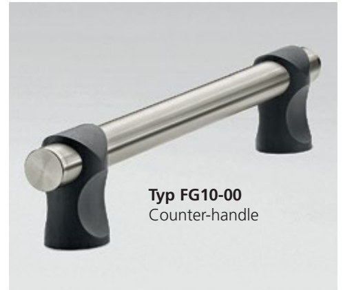
Typ FG10-00 Counter-handle